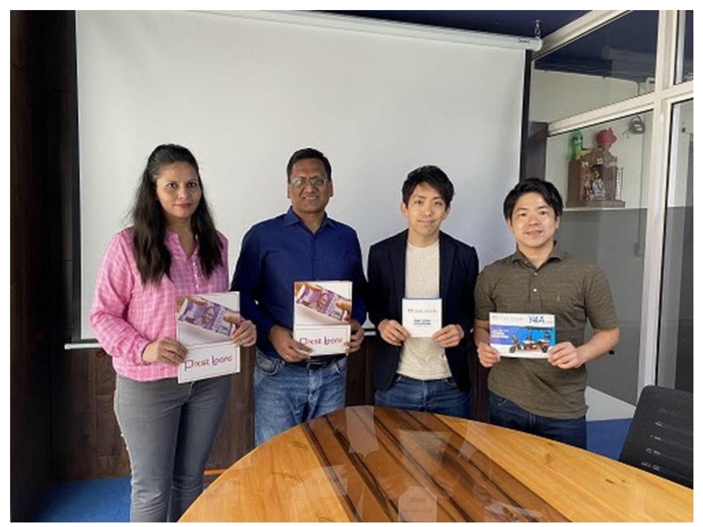
Prest Loans and Terra Motors signing the agreement